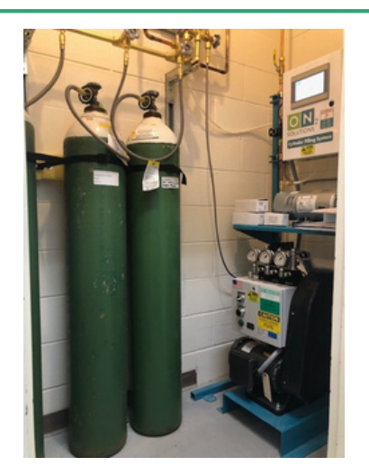
Oxygen cylinder filling station

Our boardroom underwent extensive renovation exercise this past year with the installation of a sound and mic system, along with a touch-screen tv. The walls have been painted, and the shelving replaced with framed pictures and drawings.